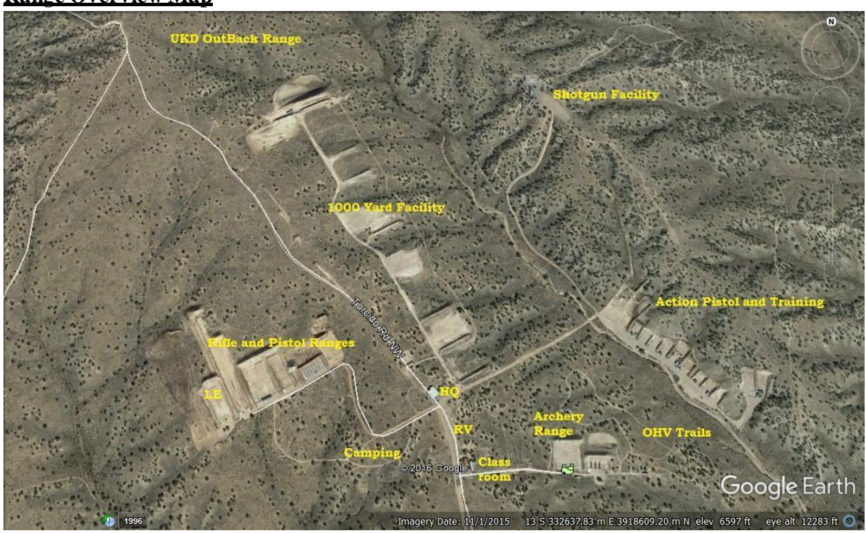
Action Shooting Bays